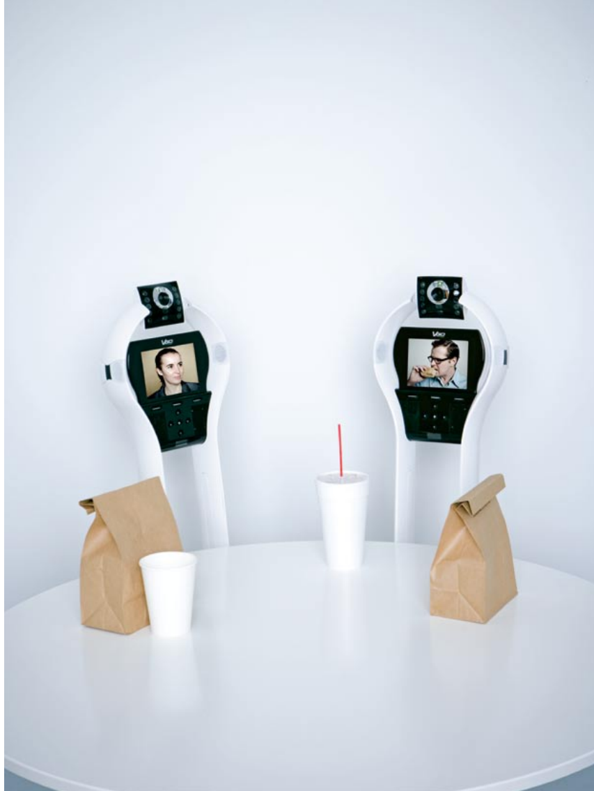
↑ Telepresence technologies in office cafeterias allow workers in different countries to share a meal or a coffee

And, at times, frustration. Because of a problem with the Internet connection between my computer and the robot, during my initial attempt I could hear only faintly what was being said to me,